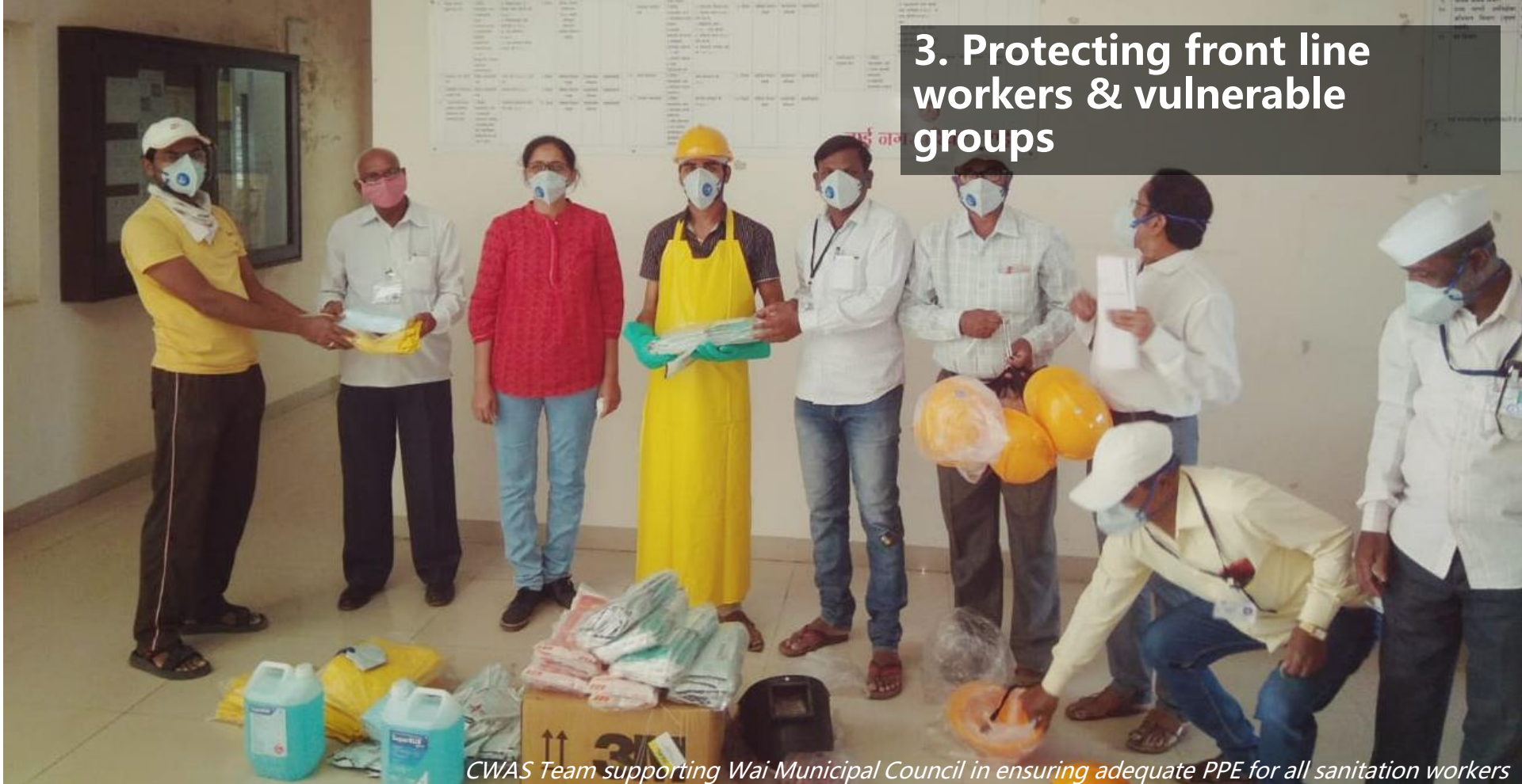
CWAS Team supporting Wai Municipal Council in ensuring adequate PPE for all sanitation workers