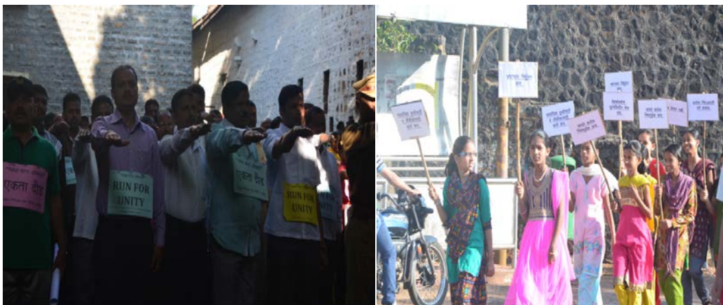
Image 3: Run for Unity rally organized as a part of awareness and public participation activity

Under SBM the city council had organized an event called 'Run for Unity' on 31st Oct 2014 on the occasion of Sadar Patel Jayanti. The event was attended by the council staff, Councillors, school and college students, teachers and the citizen of Panhala, where they all took the oath of keeping the city clean off any sought of waste and to stop open defecation.