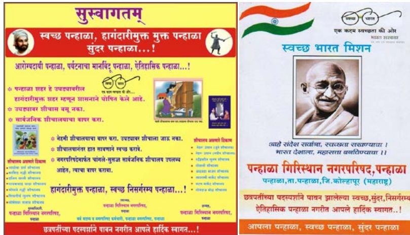
Image 1: Banners and Pamphlet prepared as a part of awareness campaign