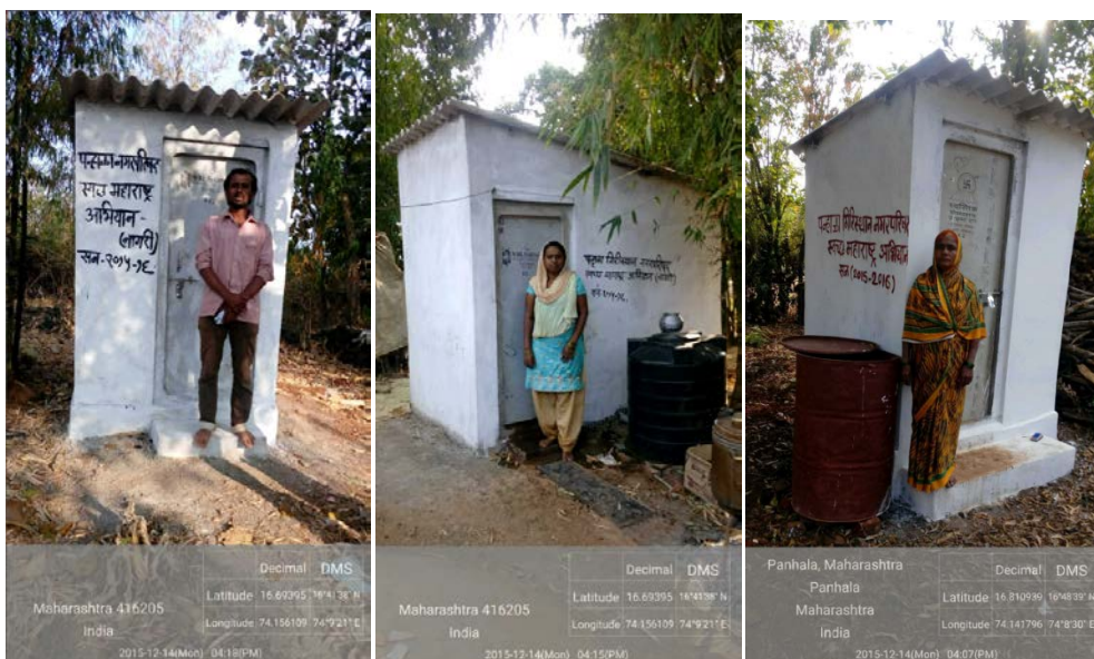
Image 2: Individual household level toilets constructed under SBM in Panhala

Household those do not have individual latrines have applied for subsidy under Swachha Bharat Mission (SBM) and Swachha Maharashtra Abhiyan (SMA). Around 126 applications have been received and 69 toilets have been approved and sanctioned for construction and are provided the subsidy. Presently 60 toilets have been constructed and 9 are ongoing. While 57 toilets will be approved by January end. The construction of all IHHL is expected to be completed by 31st March'16.