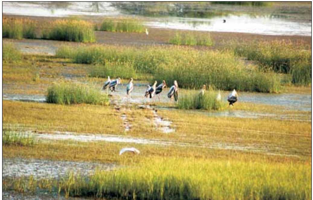
A mix of aquatic vegetation, fish and avifauna at Kharda lake in Pali district.