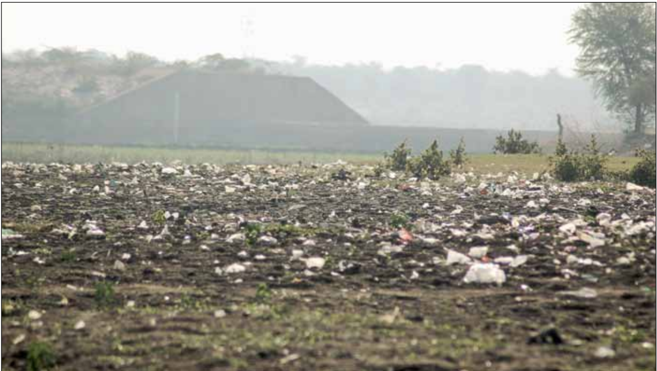
Ramchandrapura Lake now extinct (south of Jaipur).

A city of about 3 million population is estimated to produce nearly 10 crore litres of waste water daily which can be re-cycled and re-used, to amply meet the local/non-potable needs.