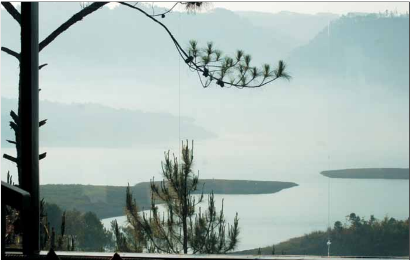
Shillong lake, an example in just use and intact watershed.

The visual quality of the communities built around the lake is highly dependent on the condition of the Water Body and the lake-shore. The natural beauty of the lake is part of the quality of life for lake-shore property owners and the entire community. The quality of a lake directly affects community property values and, therefore, the local tax base. A properly managed lake provides recreational opportunities for citizens and mode of revenue for the Government for maintaining the lake.