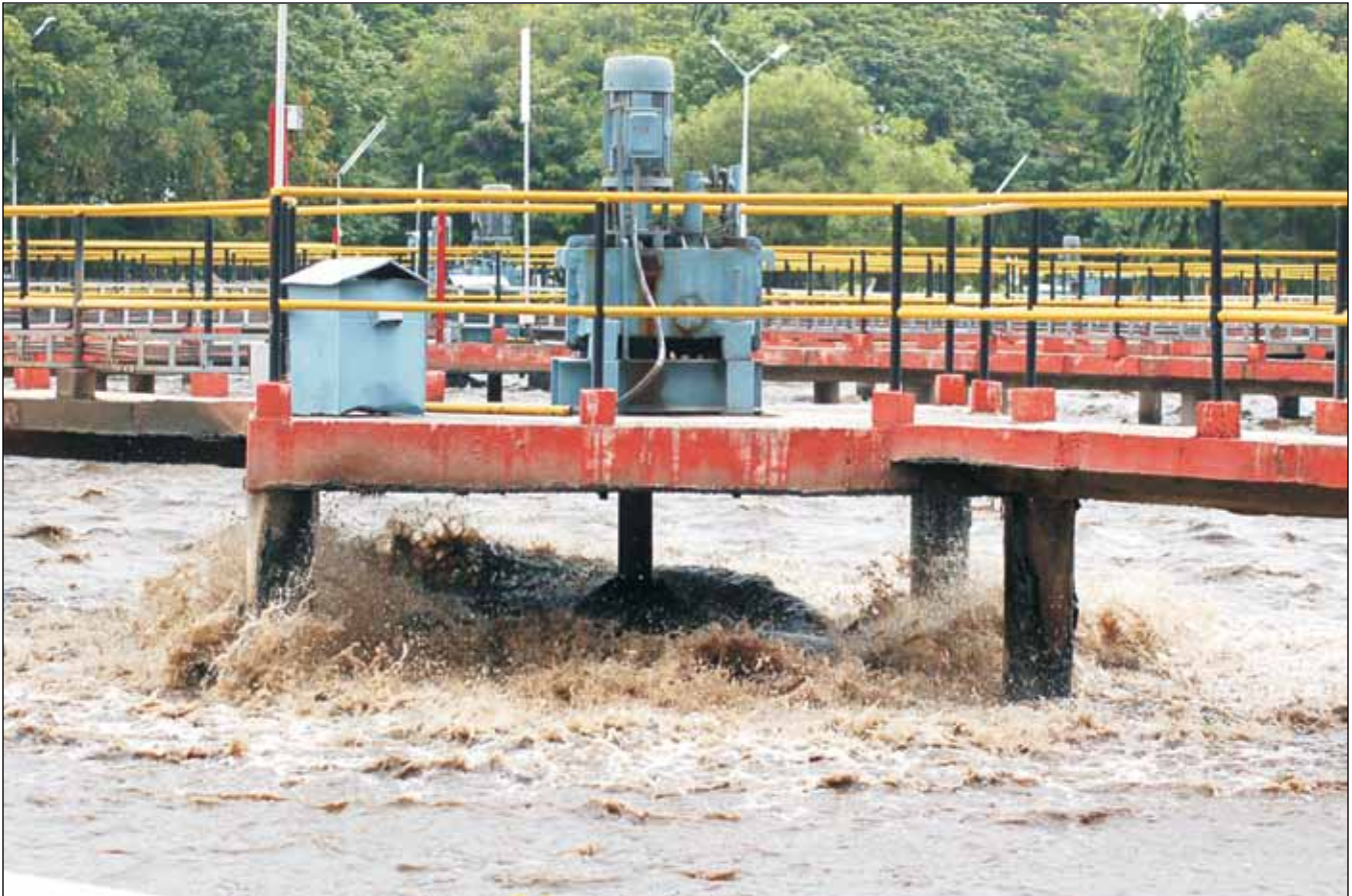
A treatment plant based on chemical-uses.

6. Measures like cleaning of Water Body involving de-silting, de-weeding, aeration, reduction of nutrient, removal of floating and other invasive aquatic plant-species or any successfully tested and technologically suitable to the local condition, may be taken up.