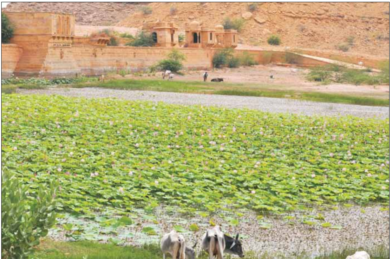
A mozaic of aquatic vegetation at Jaisalmer's Gajrup Sagar lake.

20. Alternate sources of funds for lakes will be welcome. However, the adoption of PPP as an appropriate mechanism is to be so developed that the natural resources, like lakes/ponds, are not handed over, for ever, and in to to, into hands of private partners. A tripartite arrangement can be firmed up between (a) funding agency (private company or any other sources), (b) the government agency (city or State authority) and (c) implementing agency (a public trust