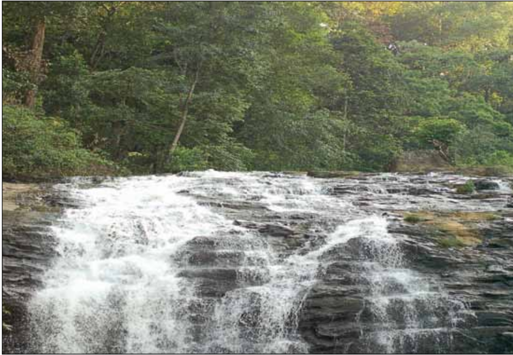
Water-shed of a lake in the Western Ghats.

The Cabinet Committee on Economic Affairs (CCEA) in its meeting held on 7th February, 2013, has approved the proposal for merger of National Lake Conservation Plan and National Wetlands Conservation Programme into a new scheme 'National Plan for Conservation of Aquatic Ecosystems' (NPCA). The merged scheme is to be operational during XII Plan Period at an estimated cost of Rs.900 crore and shall have a funding pattern of 70:30 cost sharing between Central Government and respective State Governments (90:10 for NE States).