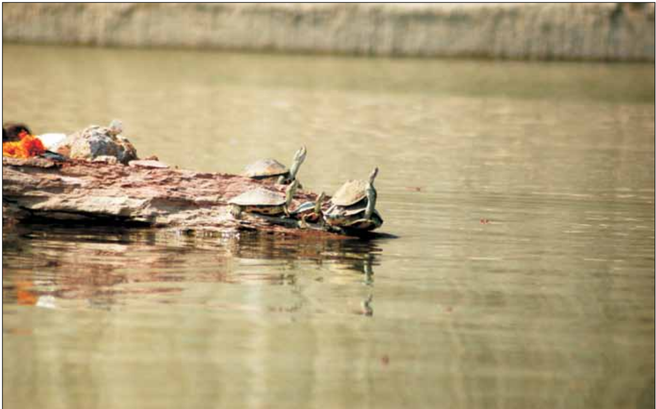
Tortoises contribute to water quality.

26. It should be ensured that each urban complex develops its Water Plan and Water Budget (for drinking, other domestic uses, industrial uses and for all remaining uses like gardening, etc.)