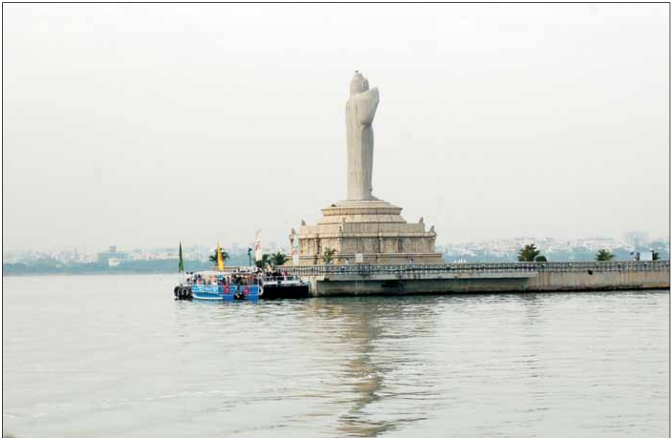
Hyderabad lake is receiving some restoration initiatives.

The landscape of India is dotted with large number of lakes, reservoirs and wetlands. Historically, the lakes have met water demands of the population for centuries and a community management system had sustained them for a long period of time.