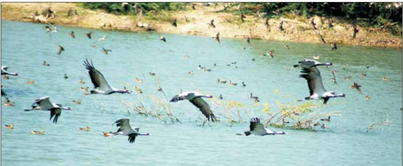
Demoiselle Cranes and ducks at a wetland.