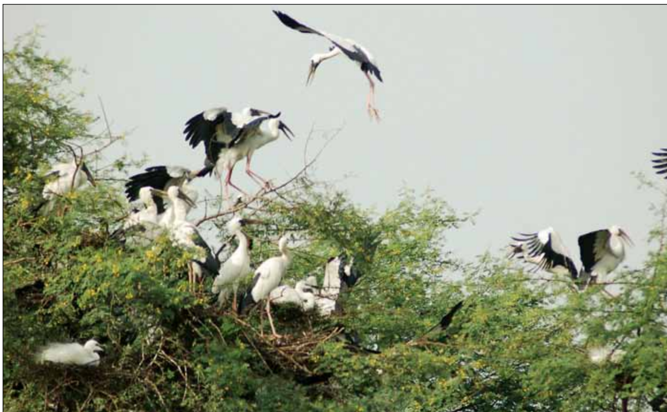
Heronries signify lake's qualities.

Government of India operationalized wetland conservation programme in 1985-86 in close collaboration with concerned State Governments. During 10th Plan 94 wetlands, 39 mangrove ecosystems, 4 coral reefs were identified for management and conservation.