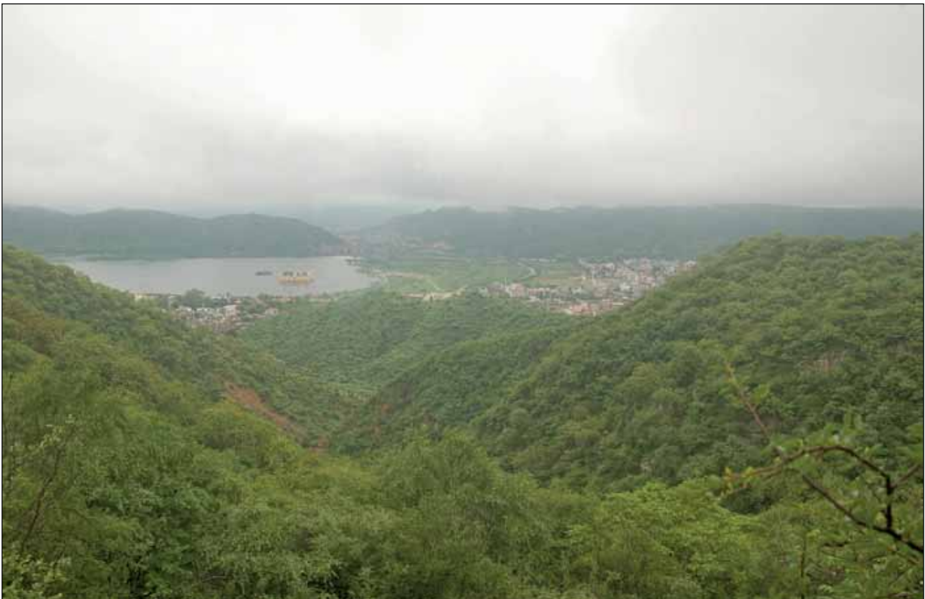
Jaipur's Man Sagar lake.