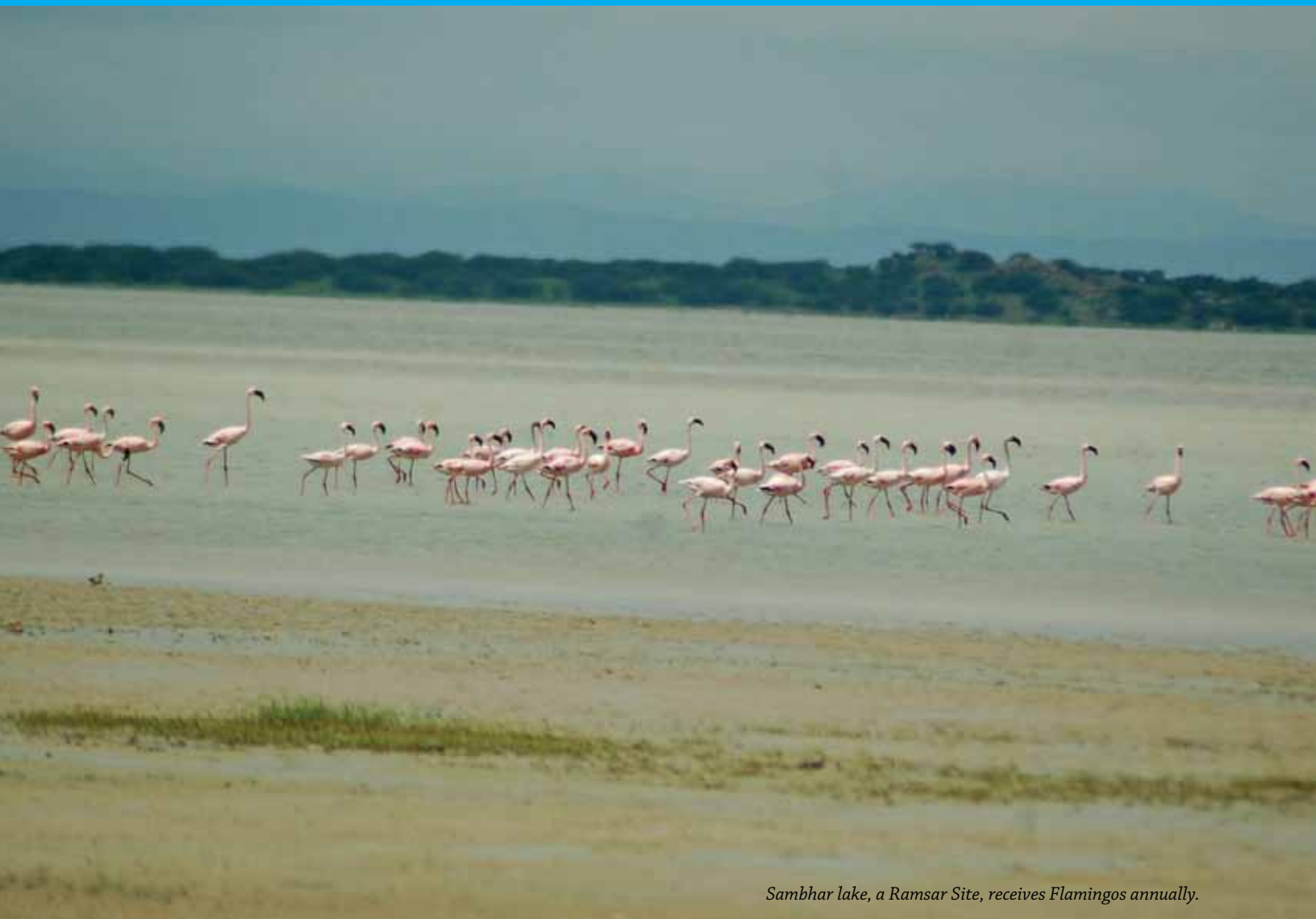
Sambhar lake, a Ramsar Site, receives Flamingos annually.

Ministry of Urban Development Government of India http://moud.gov.in