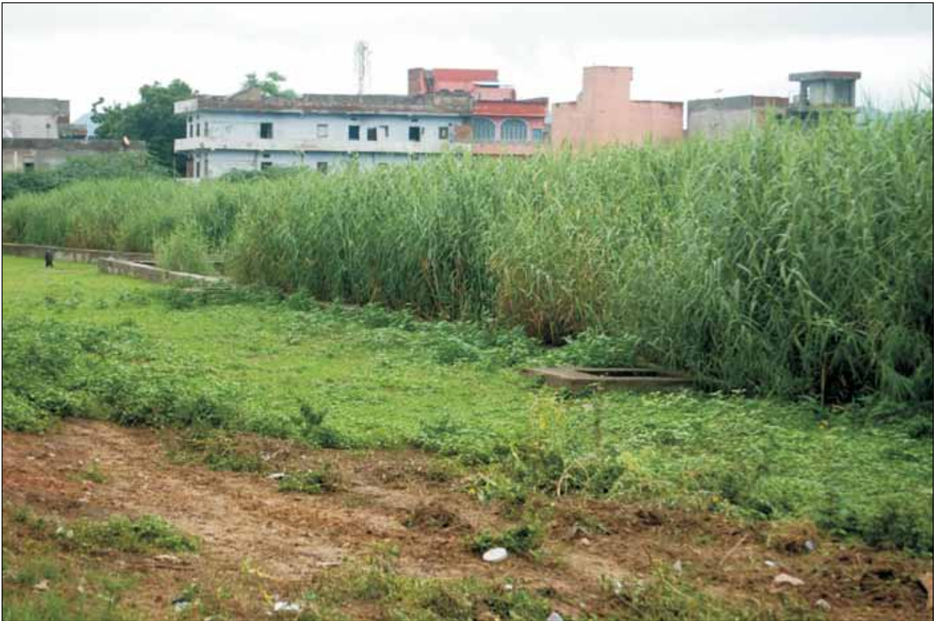
Reeds at a Constructed Wetland, the bio-treatment technique.

12. Any commercial use of the lake and its immediate surrounding areas should be properly assessed before conveying the permission.