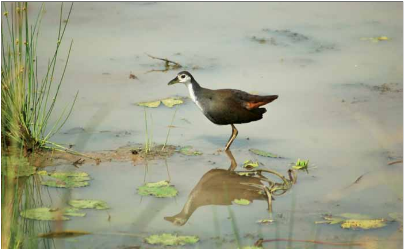
Such aquatic vegetation in a lake lures resident species to breed like this White-breasted Waterhen.

5. Any outfall of domestic/ industrial sewage into the Water Body should be prevented and only treated effluent, as per effluent standard of the State Pollution Control Board, may be allowed to dispose into the Water Bodies.