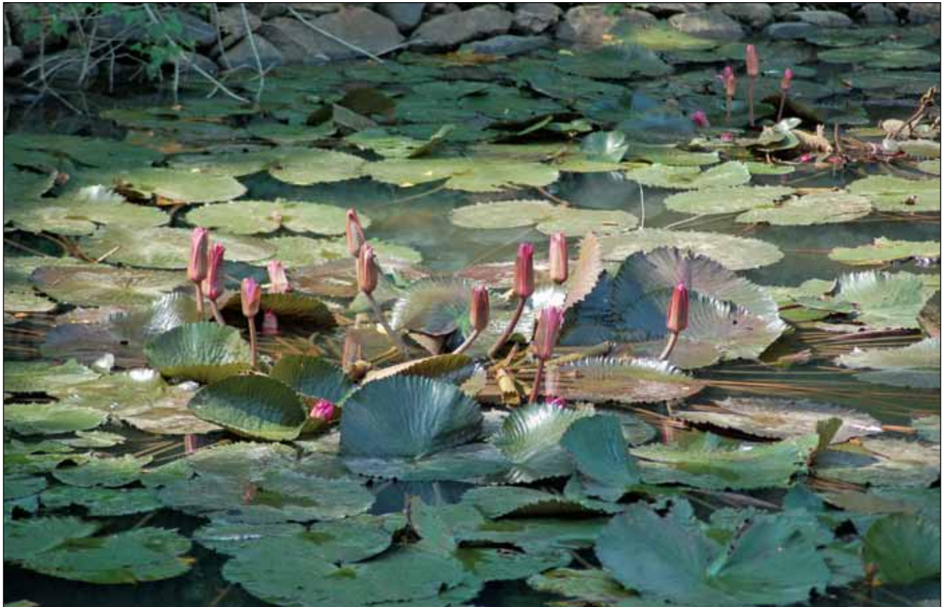
Such broad-leaved aquatic vegetation is catalyst to lake-restoration.

land slides only in case of Special Category States where such problems are common and