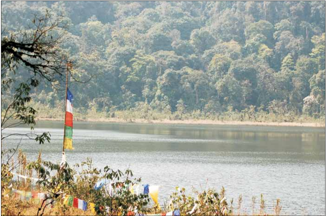
Khecheperi lake in Sikkim, a holy example.

to enable it to become self-reliant in demand-supply of this natural resource.