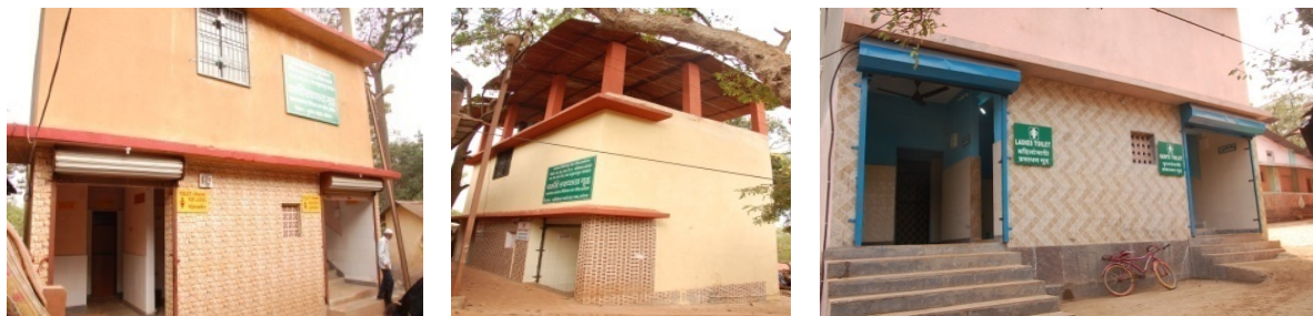
Photograph 1: Community toilets in Matheran