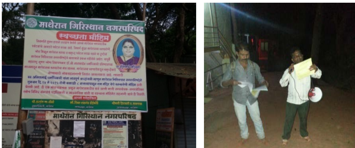
Photograph 2: awareness campaign and volunteer work

In year 2007-08, Matheran participated in Sant Gadagebaba Nagari Swachata Abhiyan and achieved second rank among class C municipal councils. During this Abhiyan, initiative was taken to generate awareness related to sanitation awareness. It was important to end open defecation as Matheran is a tourist place. Effective penetration of awareness campaign was possible because of small number of household. Door to door consultation and awareness campaigns were carried out by municipal council. People were informed about the issues related to open defecation using mega-phone. Ward Councilor generated this awareness by holding ward level meetings with the people. All these efforts helped to make the city ODF. Checking and inspection of the suspected/potential open defecation site was carried out by the Municipal council officials and sanitary inspectors.