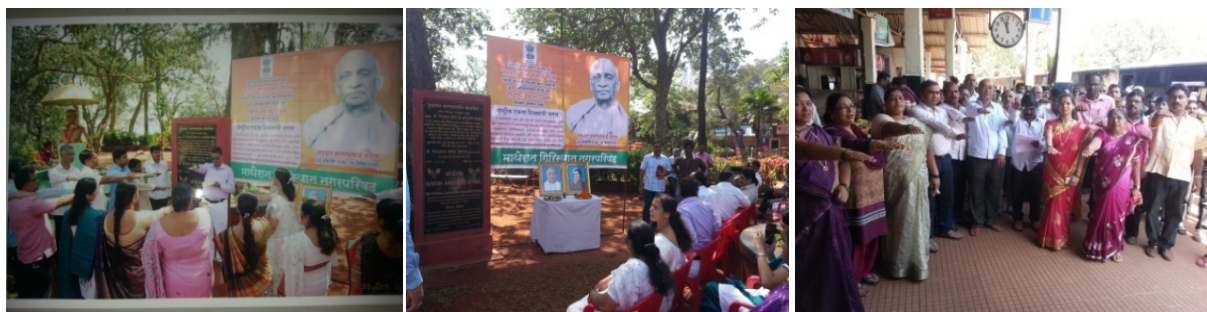
Photograph 3: Swachhta Shapath being taken

Swachhta Shapath (Oath to keep city clean) was given to all government employees, officers in Matheran MC and schools.