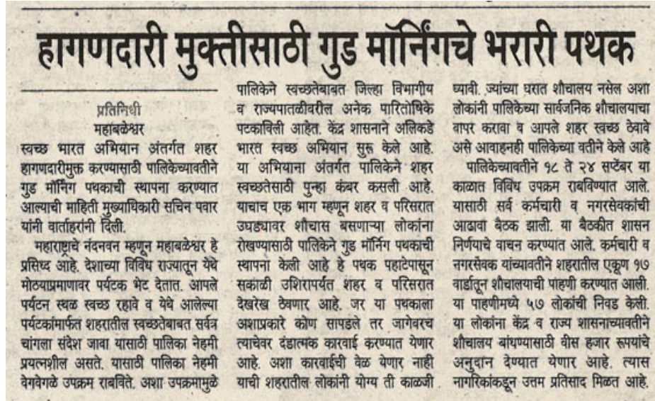
Photograph 7: Newspaper article announcing "Good Morning Pathak"

these spots. Apart from local people, the problem of open defecation was majorly created by the tourist vehicles arriving early morning to the city. Strict penal actions were taken against the people defecating in the open. They were explained the health hazards linked to open defecation and were warned to stop such practices.