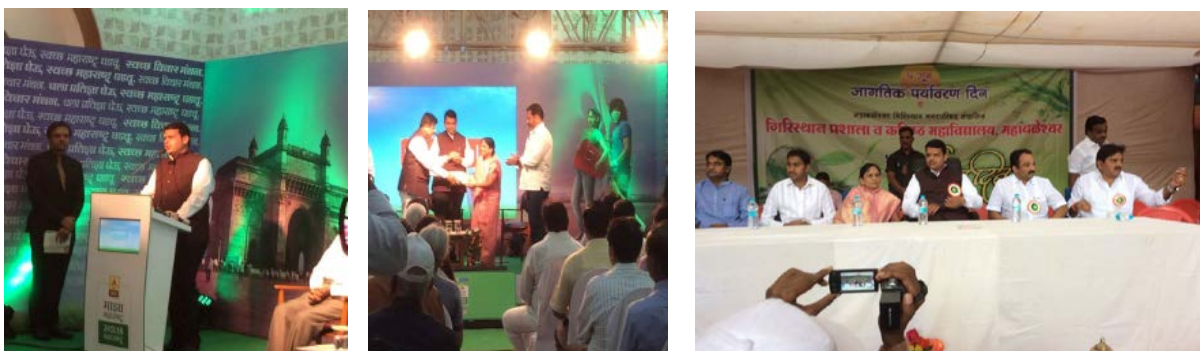
Photograph 2: Function organized for launch of ‘Clean Mahabaleshwar, Green Mahabaleshwar’ initiative