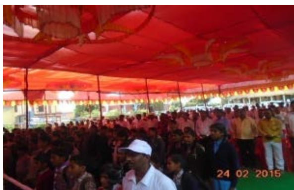
Photograph 3: Council members taking Swachta Shapath