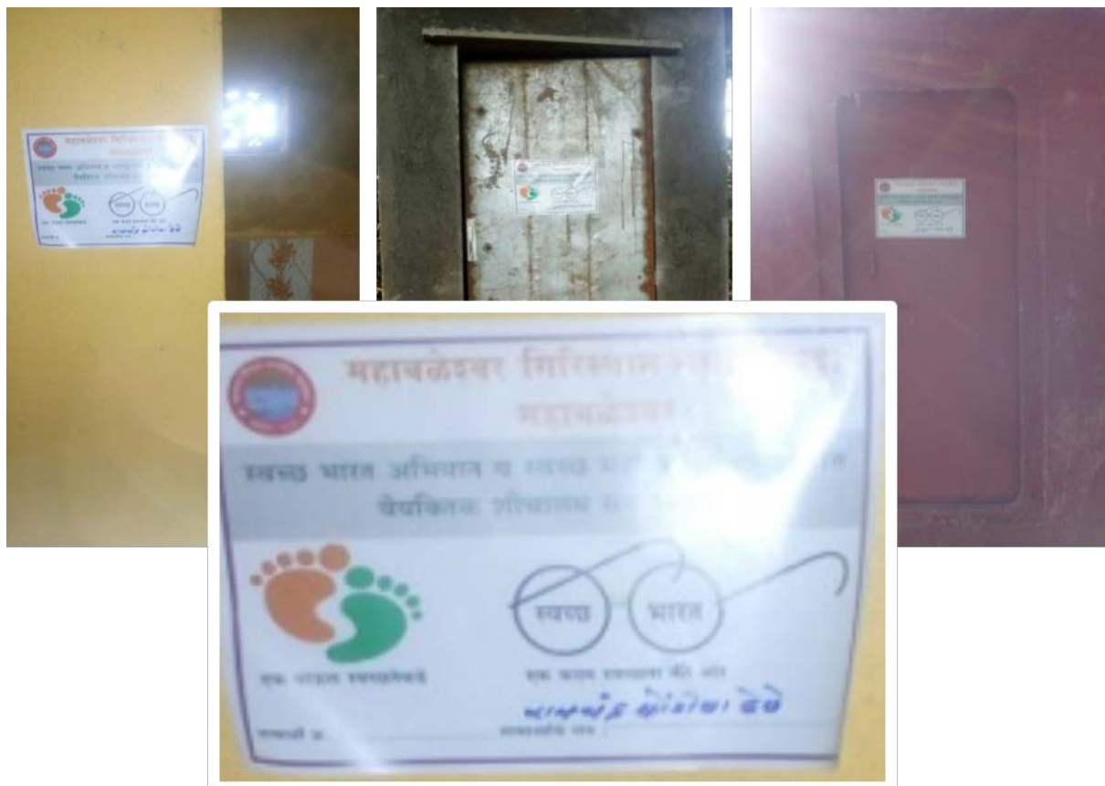
Photograph 6: Individual toilets constructed under SBM

Household that does not have individual latrines have applied for subsidy under Swachh Bharat Mission (SBM) and Swachh Maharashtra Mission (SMM). Mahabaleshwar Municipal Council received 36 applications for toilet construction out of which 28 applications have been verified and 27 applications have already been approved. Till now construction of 15 toilets is completed and 12 are under construction. The households which have not yet applied for individual toilets have shifted to community toilets.