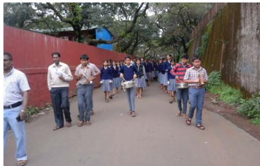
Photograph 5: Street plays and student rally