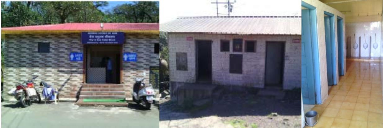
Photograph 1: Public and community toilets in Mahabaleshwar