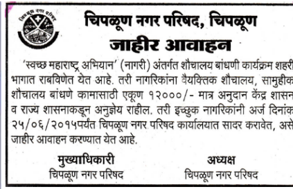
Photograph 2: Banner and newspaper advertisement