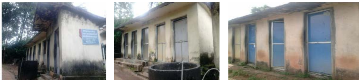
Photograph 1: Community toilets, Chiplun

Till the time all households construct their own toilets, it is imperative for CMC to provide community toilets from public health perspective. Currently some of the community toilet seats need maintenance and CMC has decided to take that on a priority so that they become usable.