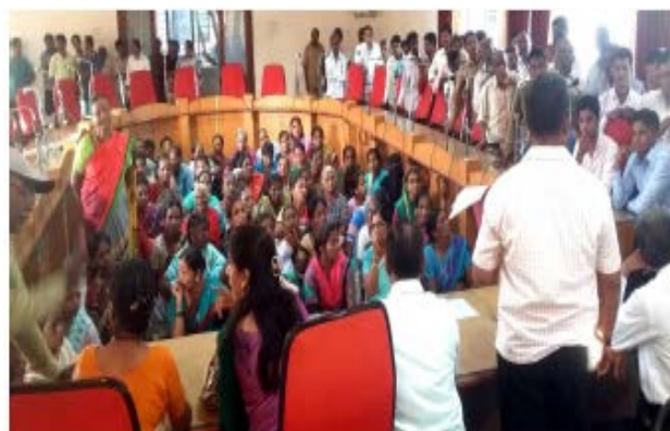
Photograph 1 : Campaigns undertaken in CMC

After declaration of pan India Swachha Bharat Mission implemented in Maharashtra as Swachha Maharashtra Abhiyan, the CMC decided to undertake a cleanliness campaign again on 11 th Nov 2014.