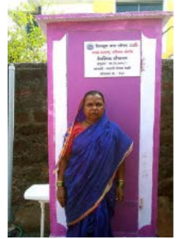
Photograph 3: Household level toilet constructed under SMMU

By mid-June 2015, 811 applications for construction of individual toilets were received. Construction of toilets sanctioned under SMMU is being monitored as per the process suggested by the guidelines. 95% of the approved applicants have already begun construction.