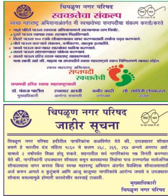
Photograph 4: Banners used for awareness generation