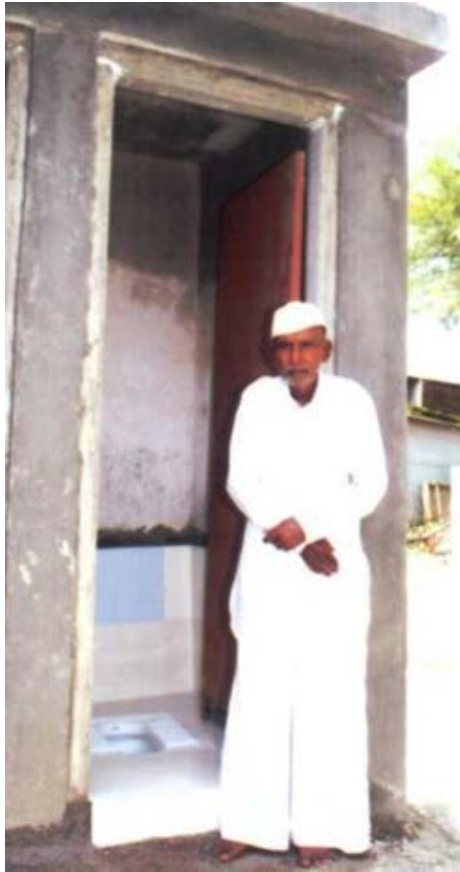
Photo 8: Beneficiary with newly constructed toilet in SMMU- Bhagur