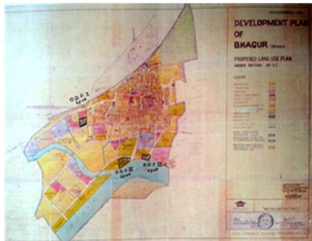
Map 2: Bhagur Map showing Open defecation spots.