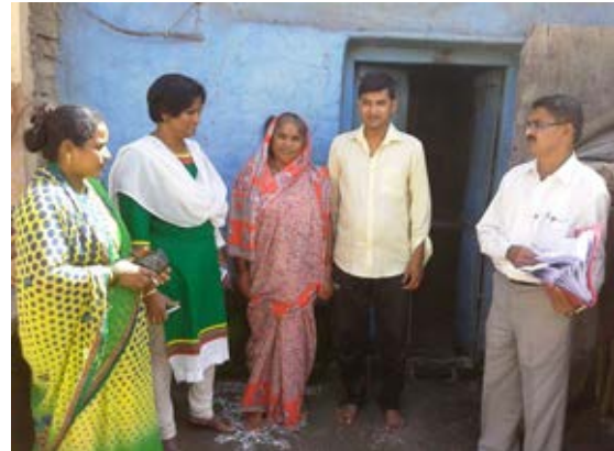
Photo 7: Council officials explaining toilet importance to the beneficiaries