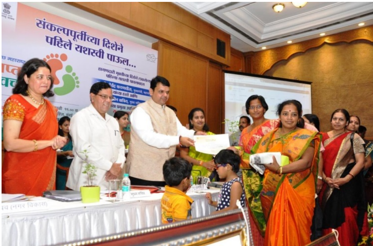
Photo 11: Facilitation by Honorable Chief Minister, Maharashtra for Open Defecation free Bhagur

On 27th September 2015, Bhagur Municipal Council was self-declared as an ODF city and submitted a report to the Government of Maharashtra (GoM). On site validation at district level was done by the collector office on 29th and 30th September 2015 and positive report was submitted to the GoM. On 2nd October 2015, Bhagur Municipal Council was awarded by the Hon. Chief Minister of Maharashtra during the State level event organized by the GoM. Further, on 23rd to 25th November 2015, State Level Validation Committee conducted an in-depth validation as per the process set and the checklist provided by the GoM. Bhagur Municipal Council passed both this validation stage and is now listed as an “ODF City” in Maharashtra.