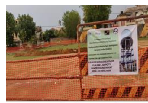
Water Supply Scheme, Ranchi