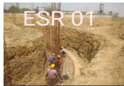
Water Supply Scheme, Chas