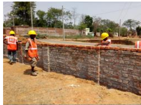
Water Supply Scheme, Hazaribag