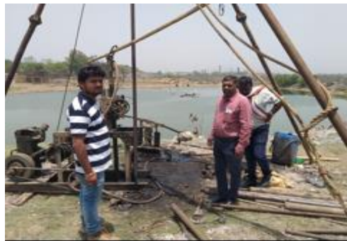
Water Supply Scheme, Dhanbad