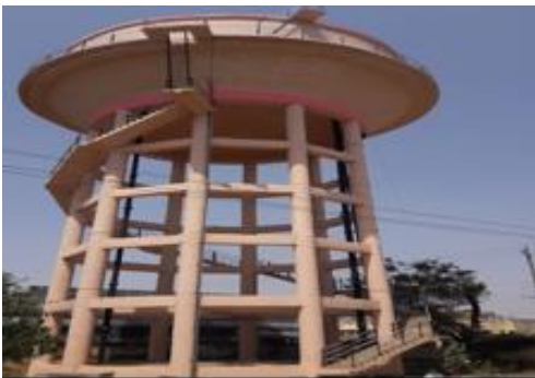
Water Supply Scheme, Giridih