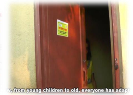
w, from young children to old, everyone has adapted