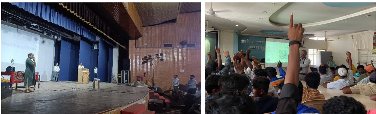
Figure 5.1: Interactive sessions with workers.

Key Takeaways: The quiz session widened the understanding of all workers about other sanitation activities. In addition to this, they are also aware of the various types of PPEs available and its uses.