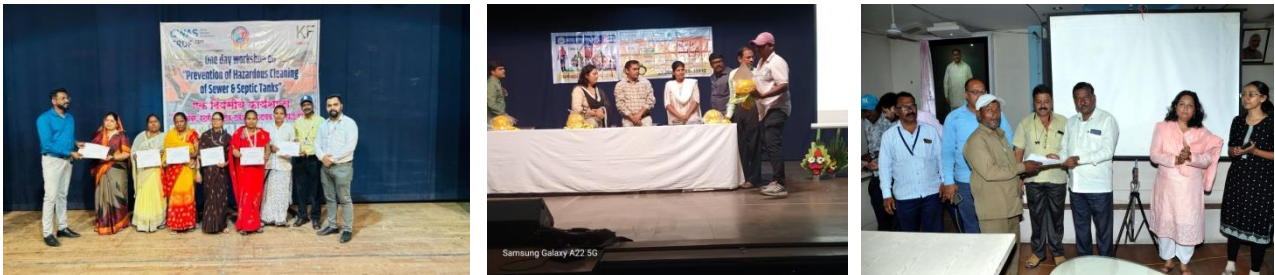
Figure 7.1: PPE and certificates distribution to sanitation workers

Certificates were awarded to participants in recognition of their engagement in the training sessions. Additionally, both the Council staff and CWAS team collaborated to distribute a range of Personal Protective Equipment (PPE) to all workers. These PPEs included various items such as nose masks, masks with valves, air purifier respirators with cartridges, orange rubber gloves, dotted rubber and cloth hand gloves, heat-resistant leather hand gloves, neoprene rubber hand gloves, nitrile rubber hand gloves, disposable gloves (blue), gumboots without steel toes (half-length), gumboots with steel toes (half-length), safety shoes, safety helmets, face shields attachable to helmets, safety goggles, reflective jackets, and aprons. The distribution was meticulously organized, with the PPEs categorized according to the specific roles of the sanitation workers.