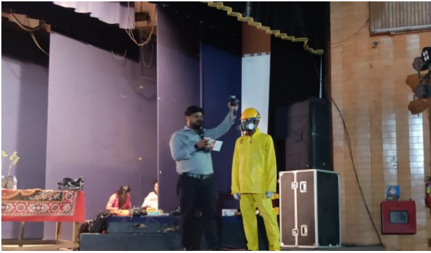
Photo collage from the trainings in the three cities