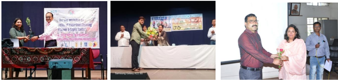
Figure 1.1: Welcome session