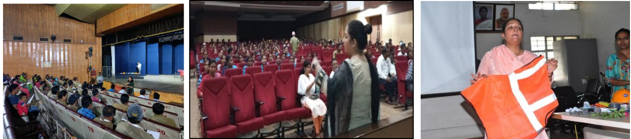
Figure 3.1: Session on occupational hazards and PPE usage.

Key Takeaways: Demonstration on usage of PPEs and first aid in case of on-ground injury was very useful for the participants. The informative session concluded by an assurance from the workers that they would use the given PPEs and stay healthy.