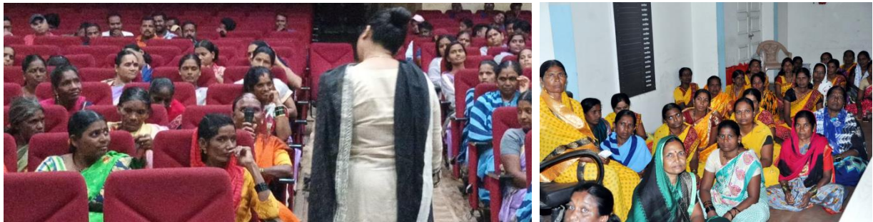
Figure 6.1: Menstrual Hygiene Management Workshop

Key Takeaways: Participants now possess a deeper comprehension of menstrual hygiene management, including the significance of proper care and the potential health impacts, empowering them to make informed choices. The distribution of sanitary napkins equips participants with essential tools for maintaining menstrual hygiene, reflecting a commitment to their well-being and overall health.