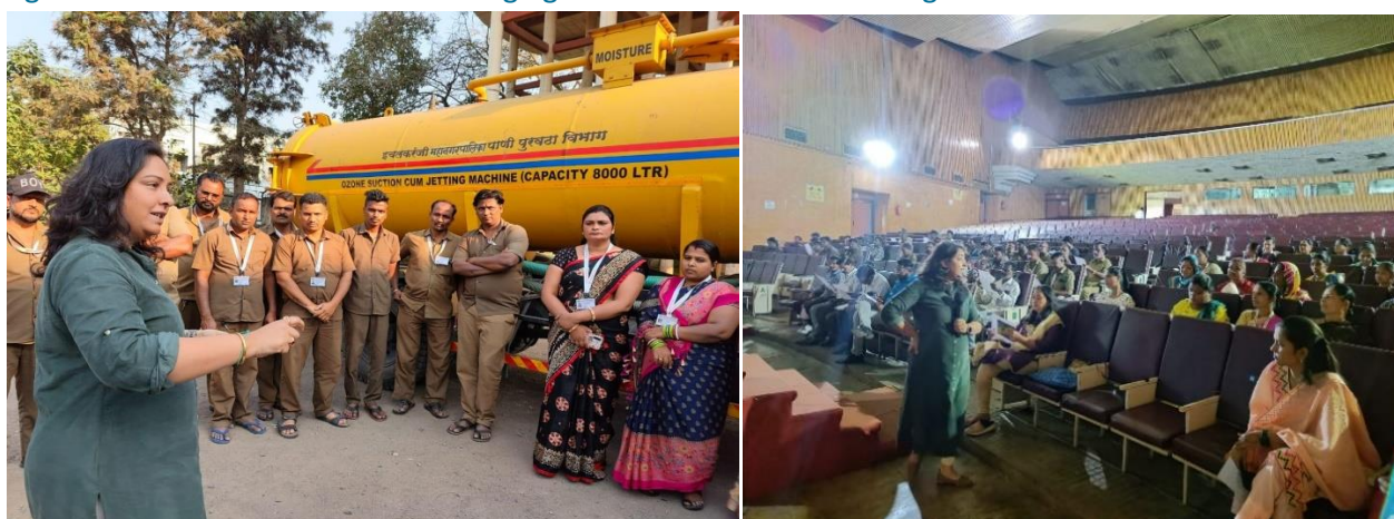
Figure 4.1: Demonstration of a desludging vehicle and various cleaning methods.

Key Takeaways: This hands-on demonstration prompted a dialogue regarding the indispensability of mechanizing sanitation tasks and the potential of mechanical equipment to imbue the workers with an increased sense of safety and dignity.